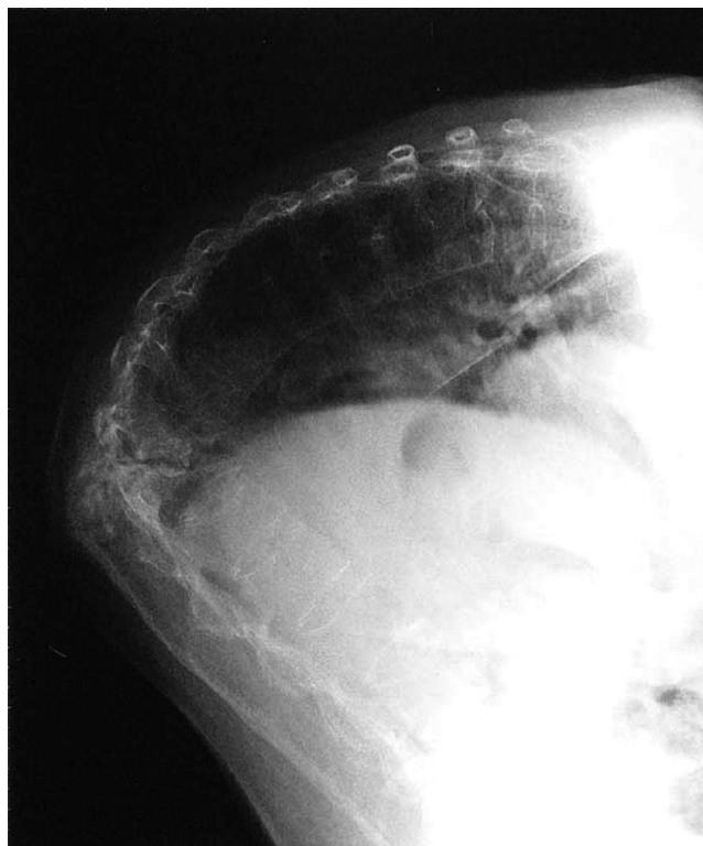
Figure 1. Typical pseudoarthrotic lesion with kyphosis in a patient with ankylosing spondylitis. Image shows an anterior extensive destructive lesion with nonunion fracture of the posterior elements of the affected segment at the kyphotic apex.

The 3 patients with neurologic deficit had postoperative improvement. The 2 patients with Frankel grade C and