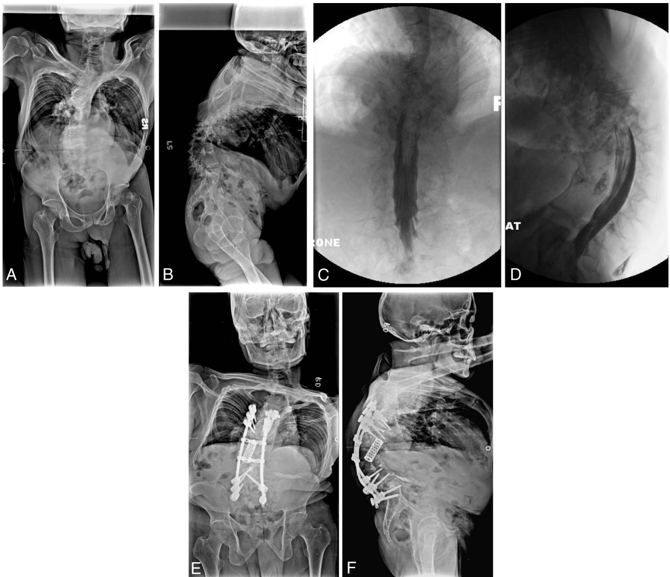
Figure 2. A 52-year-old man with Frankel B neurologic deficits due to postinfectious angular kyphosis. A, B , Preoperative lateral radiograph showed 107° angular kyphosis. C, D , Preoperative myelography revealed cord compromised at the apex. E, F , Postoperative radiographs taken 3.1 year after surgery revealed deformity correction to 68°. Neurologic deficits improved to Frankel E.

Surgical techniques for the reliable and safe correction of severe and rigid angular kyphosis with neurologic deficits are yet to be established. Leatherman and Dickson 2 described a technique for vertebral body resection using a 2-stage, combination anterior and posterior approach. Although Kawahara et al 3 introduced “closing-opening wedge osteotomy,” Shimode et al 4 described “spinal wedge osteotomy,” and Suk et al 5 described “posterior vertebral column resection.” Further to this, Sar and Eralp 6 described a technique for resection of posterior spinal elements and vertebral body and correction of the deformity using a 3-stage combination anterior and posterior approach. All the aforementioned surgical techniques correct angular kyphosis by exposing the apex circumferentially, using the anterior and posterior approach or the single posterior approach and performance circumferential spinal osteotomy. The corrective procedures involve shortening, distraction, and translation of